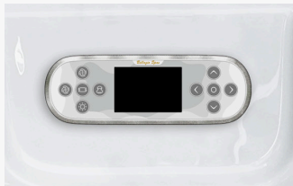
Digital Topsiside Control